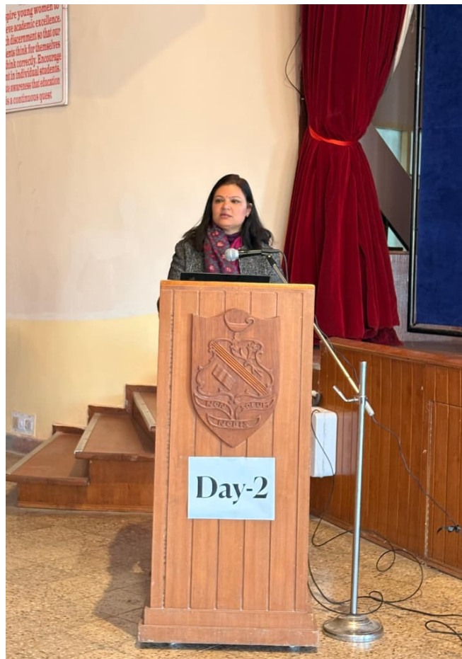
Awareness Talk on Women's Rights: Laws, Protection and Empowerment